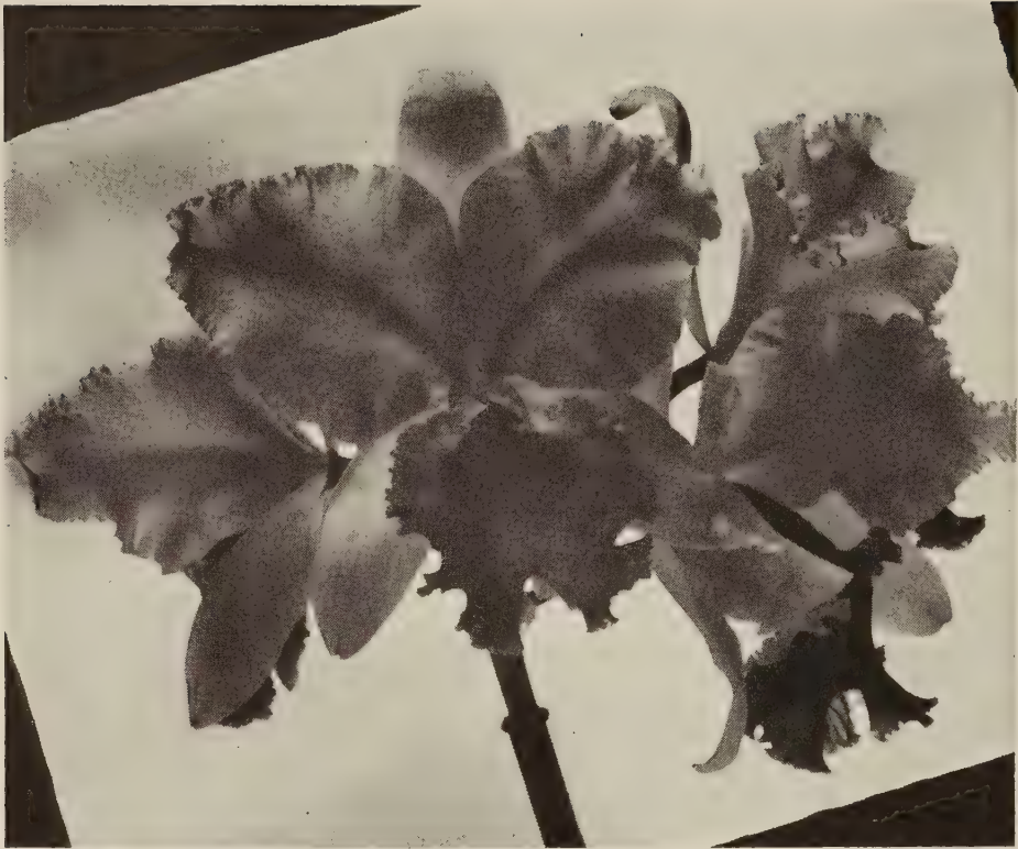
C. LABI-ROYAL (C. Labiata x C. Mt. Royal)

This fine flower is representative of the shape and color we expect in our hybrid C. Mt. Royal x C. Fabianid, which we offer as S-4.